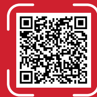
General Education Courses